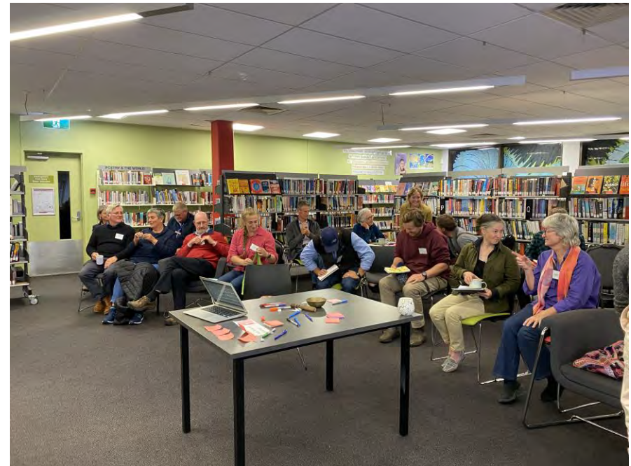
Climate Ready Communities workshop