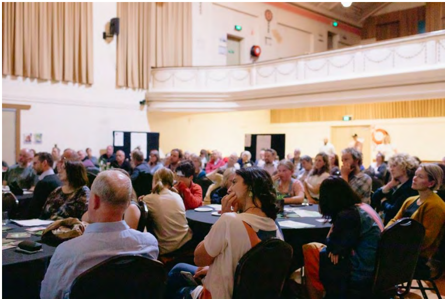
Cool-ER Changes launch

The ultimate aim of Cool-ER Changes is to critically analyse the climate actions already underway within our community groups, businesses and Council operations and identify additional actions and opportunities to respond and flourish within a changing climate.