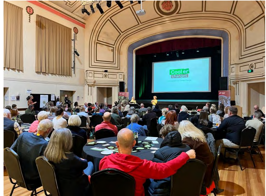
Cool-ER Change launch