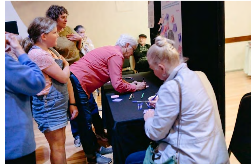
Participants told us their future vision for each of the Cool-ER Changes at the launch

A prioritisation activity concluded the workshops with participants voting for their three "must do" actions with sticky dots . The actions with the highest scores and most number of sticky dots indicate the actions with the most support and effectiveness in responding to the climate emergency.