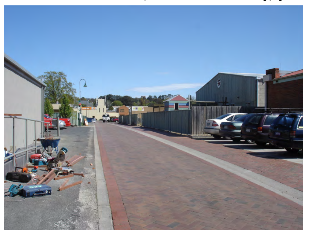
Heritage Way today

These ideas are illustrated in the Concept Plan and sketch on the following page.