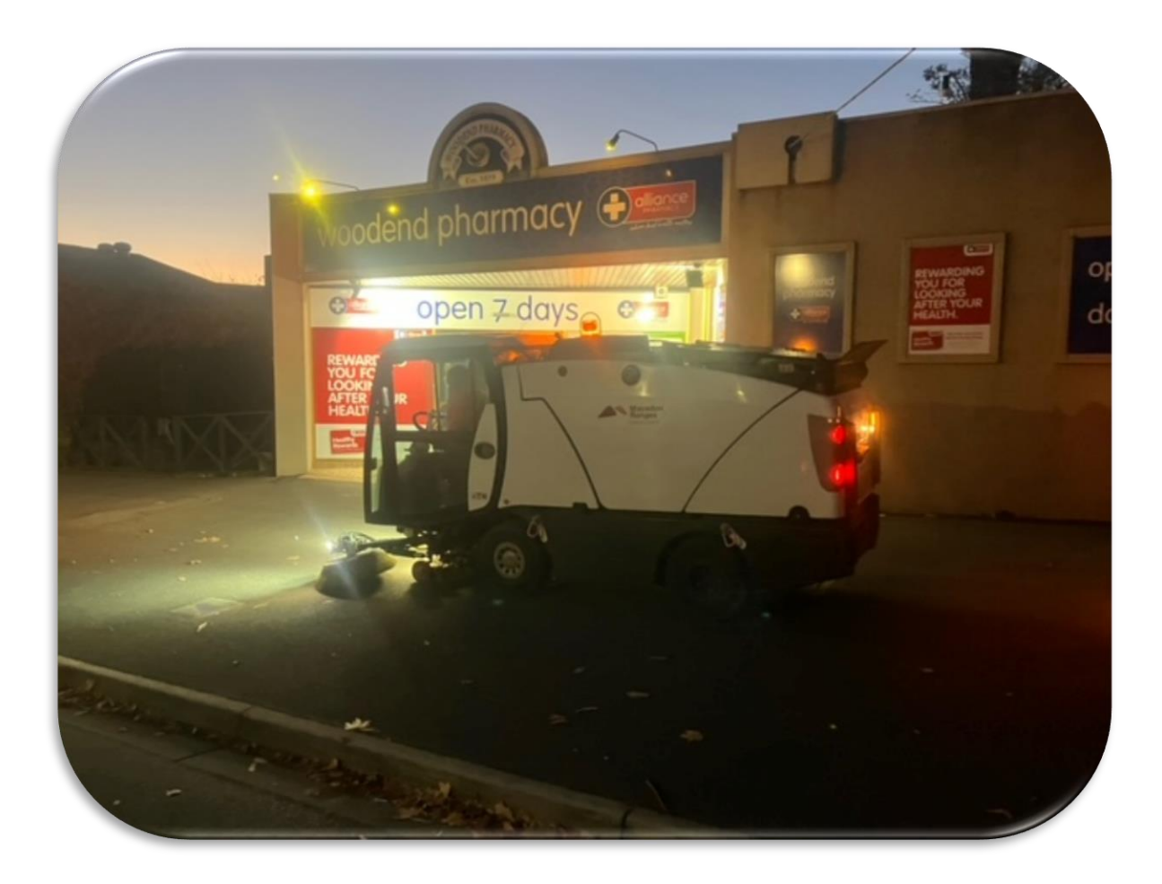
Figure 1 Early morning cleaning by footpath sweeper in the Woodend township centre

The general environmental duty requires that when activity occurs outside 'normal' hours the provider of the service or activity must utilise 'industry best-practice' to conduct the activity. Current best practice is to produce a noise management plan for consultation and approval.